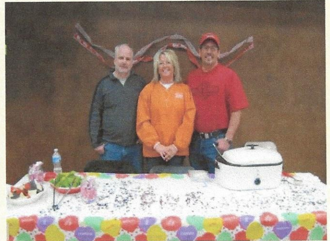
2011 Restoration Fundraiser Chili Cook-off First Place Winners, Integrity Title/Alex YMCA

Brandon Fire Department took second place; the Brandon Lions walked away with the People's Choice Award; and Gardonville received the Best Theme Award.