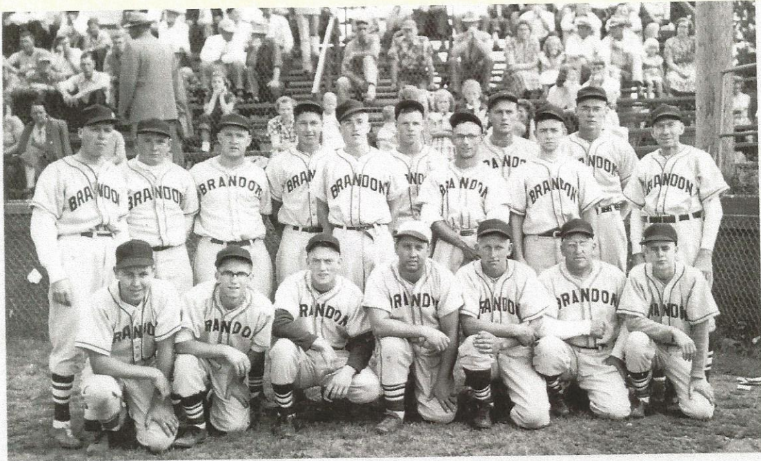
1951 Championship Brandon Team