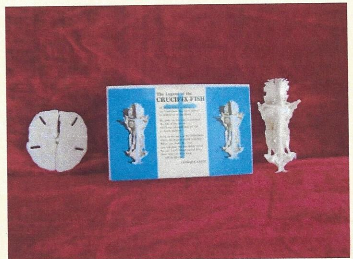
Legend of the Crucifix Fish