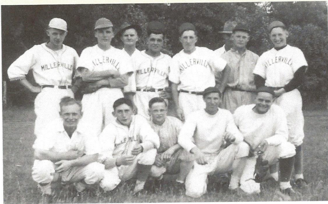
1944 Millerville Team