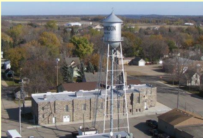
Current Water Tower which will be torn down as soon as its replacement is constructed.

Construction of a 100,000 gallon elevated tank has begun. The new location of the well and water tower will be on the south-east corner of the block on which the liquor store is located. The engineers are Design Tree of Alexandra, and the contractor is General Construction Services from Stillwater. The project is financed by the U.S. Department of Agriculture, Rural Development.