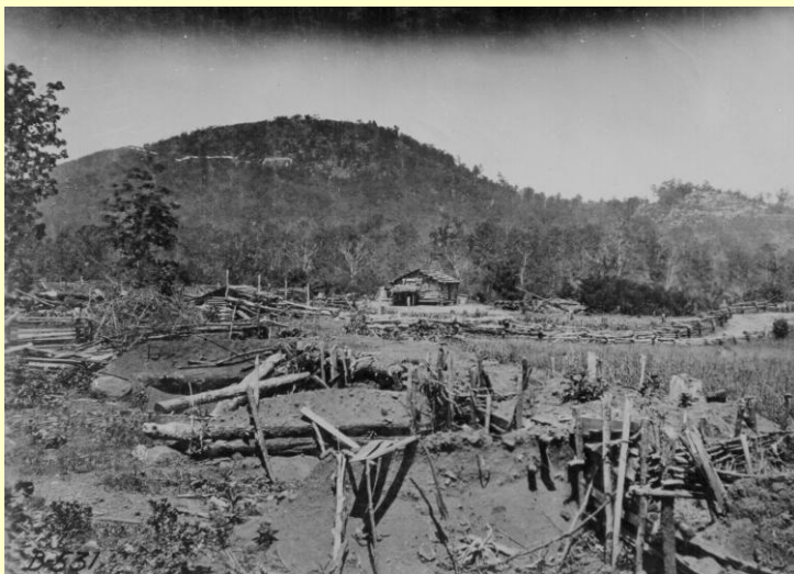
Actual Photo of Kennesaw Mountain Battle Field