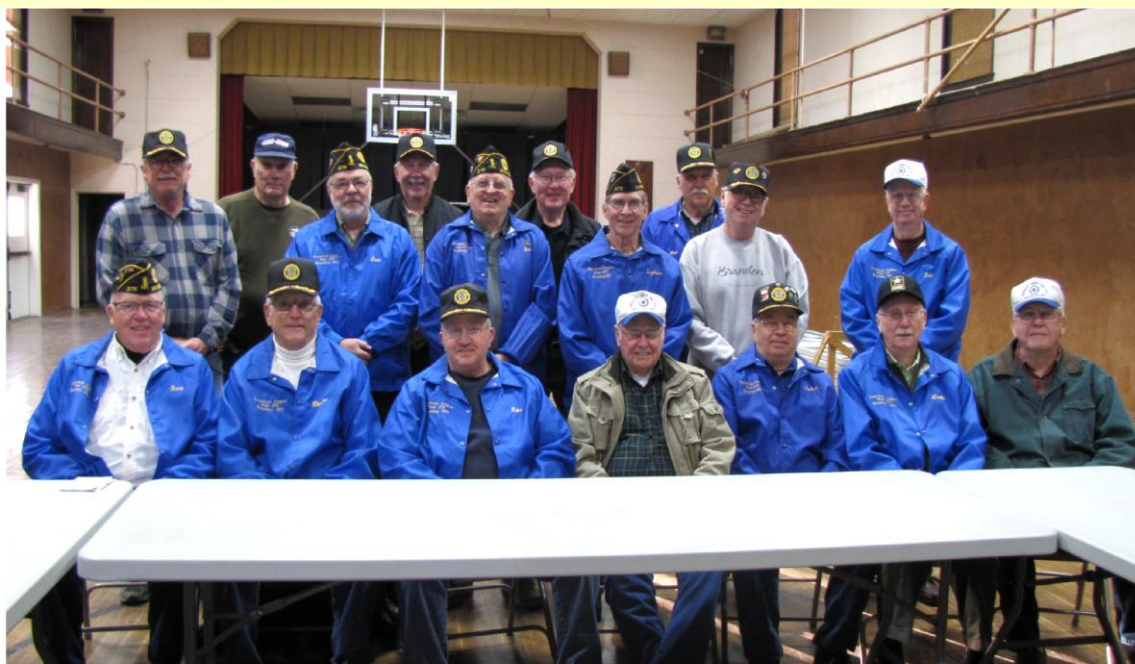
Argonne Forest American Legion Post # 278 -- Brandon MN