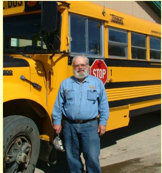
Bruce Nelson Bus Service