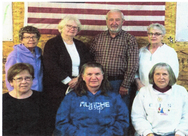
Brandon History Center Board Members 2020