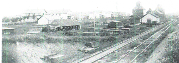
View of Brandon, 1890

To assist in the preservation of the Historic Brandon Auditorium and other local historic sites.