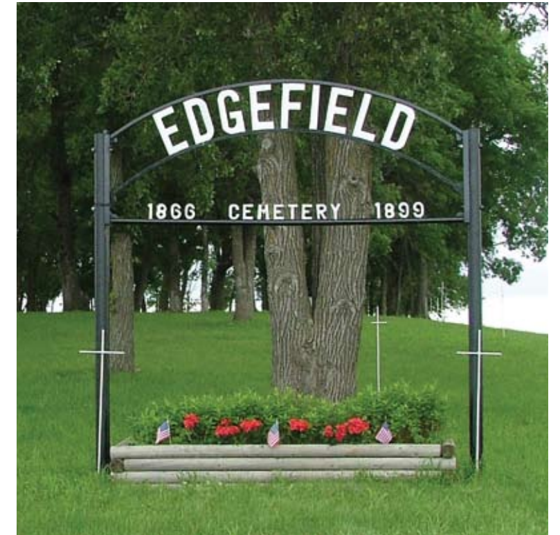
Pioneer Area Cemetery located near Chippewa Station and the Abercrombie Trail