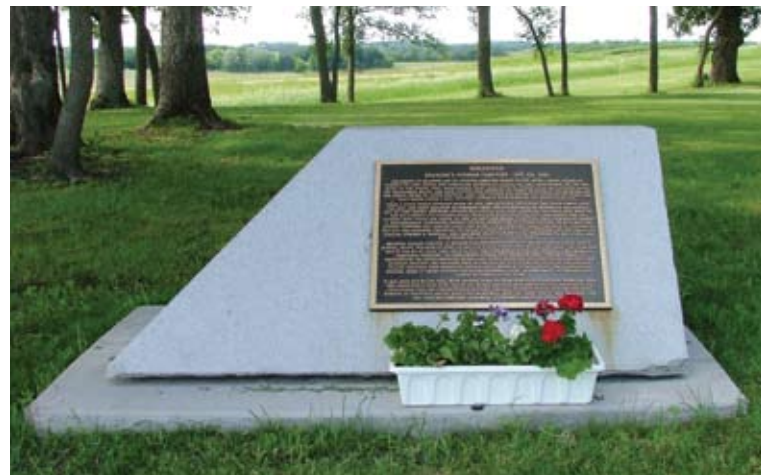
Edgefield Monument was erected December 9, 2005