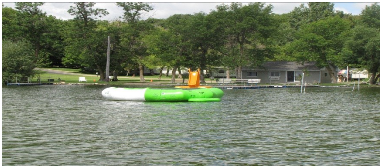
Westwood Beach Resort on Big Chip