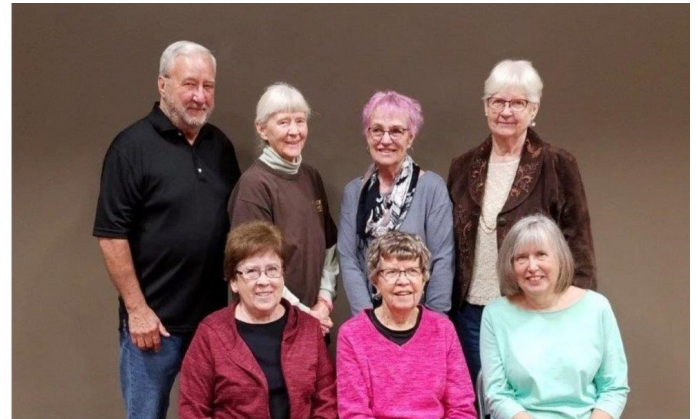
Brandon History Center Board 2021

We are also looking for new volunteers, especially if you have a passion or interest in history. The pay is non-existent but the non-monetary rewards are numerous.