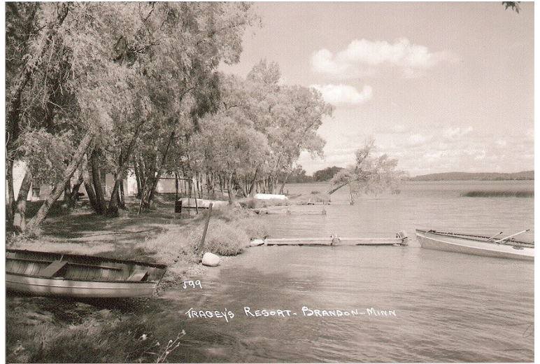
Tracy Resort on Big Chip

Did you know that we have our own “chain of lakes” right here in Brandon Township? The “Chain” begins with Big Chippewa Lake on the east side of the township and flows west to Devils Lake which is then connected to Little Chippewa Lake which, in turn, flows down Hoplin Creek to Stowe Lake from which the Chippewa River flows west to meet the Minnesota River at Montevideo, MN. Whiskey Lake is also connected to Big Chippewa Lake.