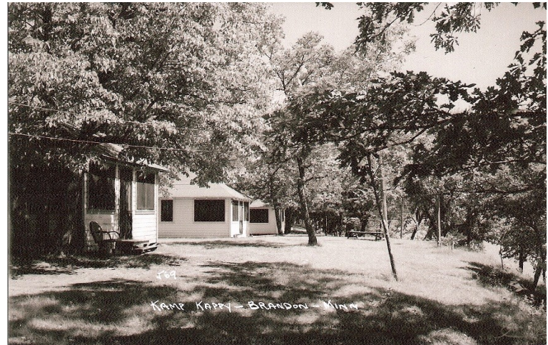
Kamp Kappy on Devils Lake

Information on the history of the ownership and operation of these resorts can be found in the Brandon Centennial Booklet located on the Brandon History Center website at brandonhistory.org .