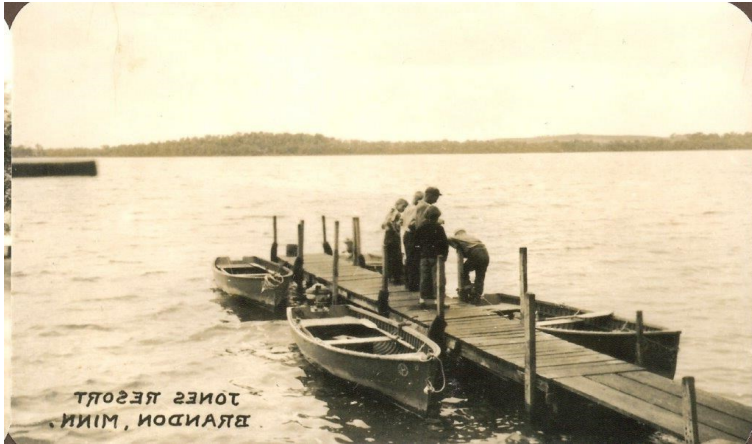
Jones Resort on Big Chip