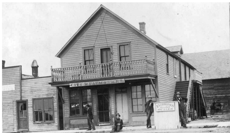
Brandon Meat Market, circa 1890

The History Center is usually open Friday mornings from 9 to noon, but since it is staffed by volunteers, you may want to verify before planning a visit by emailing brandonhistory@gctel.com .