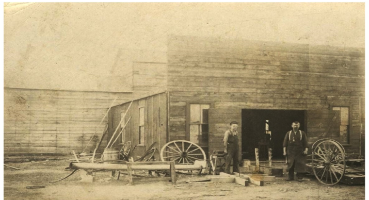
Millerville Blacksmith Shop, 1898